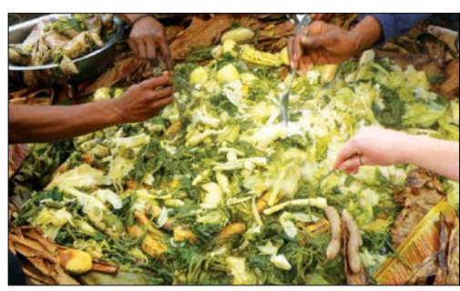
Mumu-wrapped in banana leaves and cooked in a pit

God with these people. After church we visited a village where they prepared a mumu (traditional meal) for us. It was a half hour walk to the village, walking along a dirt trail through bush. It is humbling to see how these people live and how happy they are to share with the 'white skins'.