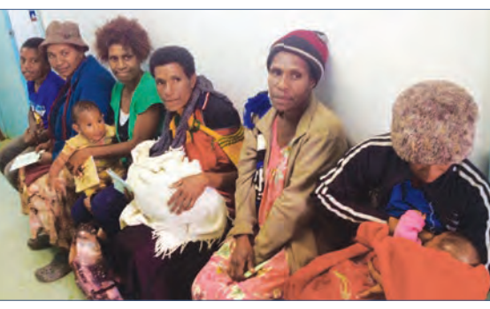
'Volunteers' waiting their turn for an ultra-sound

It was a very rewarding time, especially seeing the medical staff going from not knowing how to hold a probe, to being proficient ultra-sound operators. The down side for me was the great sense