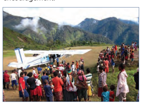
Airplane arrival is not an everyday occurrence and worth stopping what you are doing to come and watch. One of the Yajasi pilots grew up in this village, his parents Wycliffe Bible translators

Hospitality came a very close second. A Wycliffe social committee organised a meal for us with a different host family every night. The prospect at first was rather daunting, especially as our working days were long, but we thoroughly enjoyed every evening. The hospitality was not only with pilots and mechanics, but also doctors and translators, single women, to families with eight children. Each evening was an opportunity for Christian fellowship and encouragement.