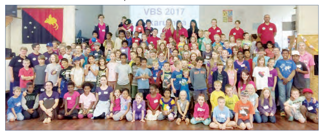
The full team of leaders and students at the Vacation Bible School, Ukarumpa 2017

There were three groups in the team; one to run a Vacation Bible School (VBS); one to do a building project and one team to offer medical assistance and training to the staff at Ukarumpa. Here are the reflections of two first-timers to the trip.