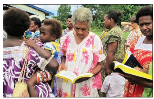
Distributing Scriptures after church

The warmth and encouragement of working with colleagues, participating in Scripture distribution and other aspects of missionary life, was a real joy.