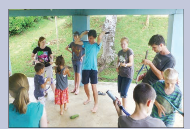
Enjoying some 'air guitar' during conference

It was a delight to help the parents and the work of Bible translation in this way and it was a highlight for us to link our faith to service.